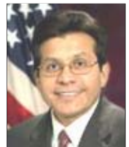
Al Gonzales Decides to Resign as Attorney General

Highlights include excerpts from various movies with Latino actors, stories or themes, including the Academy Award-winning West Side Story (1961), Neptune's Daughter (1949), The Ballad of Gregorio Cortez (1982), Stand and Deliver (1987), and others. Running Time: 140 mins