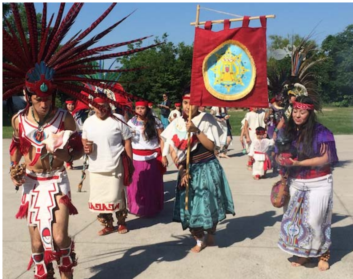
ABOVE: Students at the Academia Cuautli practicing a danza.

subjects for the district’s dual language program. Valenzuela says that the participating teachers the Academia Cuauhtli are rotated